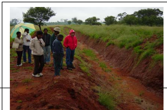
Participants in an access control survey

The access control surveys provided an effective means of interacting with regular users of the site. They provided valuable information in understanding why patterns of unsafe use of the site continued despite the upgraded paths and also provided the opportunity to educate regular users of the dangers associated with the site.