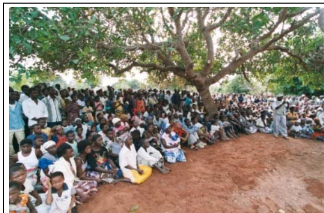
The Community Liaison Group holds an information session with the community of Maimelane in the gas field, to explain progress in implementing the project

The company adopted a view that failure in the field of stakeholder engagement would be considered a general failure for the company. The country manager for the company said in an