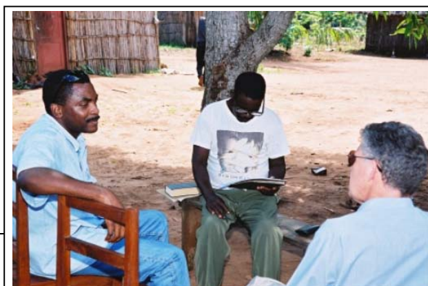
Consultation with a local chief

It was agreed early in the process with the Mozambican Environmental Ministry that consultation during the environmental assessment would be focused on community level leaders. It would not be required that individual members of communities be consulted. This was